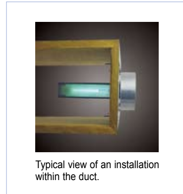
Typical view of an installation within the duct.

activTek INDUCT 2000 can be installed in any HVAC system directly into the plenum or directly above the air handler in remote or “down stream” locations.